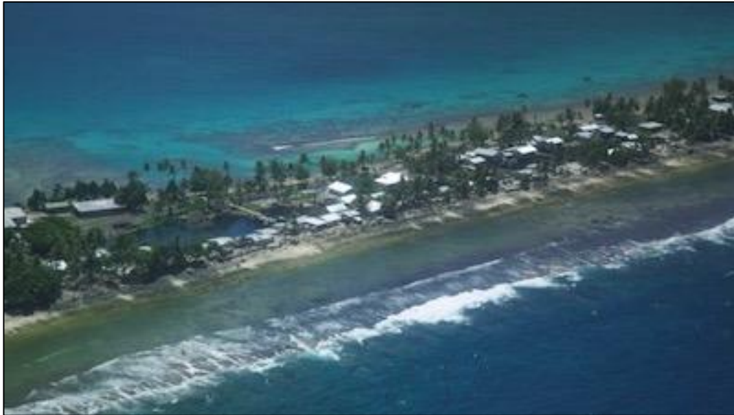
Figure 5: For the atoll nation of Tuvalu, appropriate technologies such as eco sanitation are key to maintaining water security and minimising wastewater pollution to coastal waters (SPC)

approximately 30% - equivalent to eight to ten 10,000 litre rainwater tanks per household per year. Social and design lessons learnt from this demonstration have made eco-sanitation a key part of Tuvalu's response to climate change. Tuvalu is now a centre of regional expertise on eco-sanitation, and in the Pacific way has been active in sharing its findings with other atoll countries struggling with the pollution impacts and water demand associated with flush toilets.