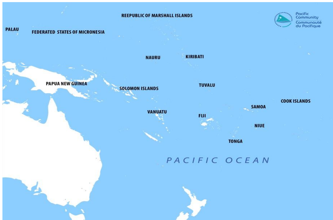
Figure 1: The 14 Pacific island countries of the sub-region, shown alongside Australia and New Zealand

The sub-region comprises a diverse range of island types, including volcanic, raised limestone, atolls and sandy islets, each with their own water resource characteristics (a summary of the geophysical and demographic characteristics of each Pacific island country can be found at Table 1 below). For many Pacific island communities, the availability of freshwater resources is confined to groundwater lenses, small streams and rainwater collected from roofs. These scarce resources are vulnerable to overexploitation and contamination, particularly in small island environments, where limited potable groundwater sources can be threatened by over-exploitation, land use activities and inappropriate sanitation facilities.