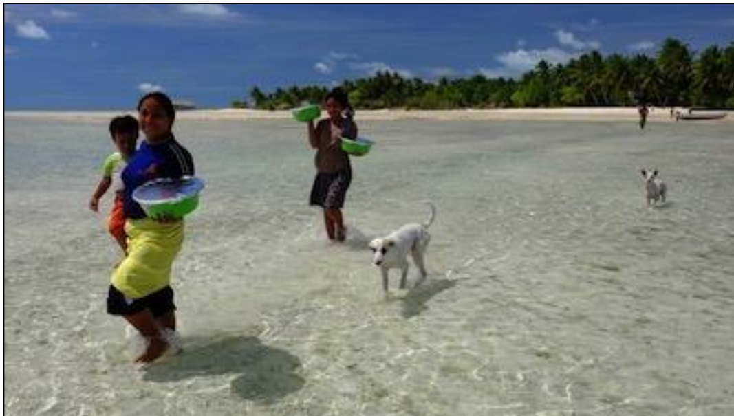
Figure 4: The water security of the community of South Tarawa relies on the sustainable management of a single shallow aquifer (SPC)

The island of South Tarawa is home to approximately 55,000 people, comprising around half the population of the Republic of Kiribati - an atoll country of 33 small islands spread across some 3.4 million square kilometres of the Pacific Ocean. Here, potable water supplies depend on the sustainable management of a single shallow aquifer at the Bonriki Water Reserve. In order to better manage this fragile water lifeline, the Government of Kiribati has been working with regional partners to survey, model and regularly monitor the groundwater lens, and has used this knowledge to develop a practical drought management plan that identifies management responses at various trigger points during and in anticipation of periods of low rainfall. The drought management plan has been designed to enable the sustainable management of the lens throughout all conditions, and is an important tool in supporting national efforts to adapt to the impacts of climate change and population growth. In the spirit of Pacific regionalism, Kiribati is now sharing this approach with other atoll nations facing similar pressures on their potable groundwater reserves.