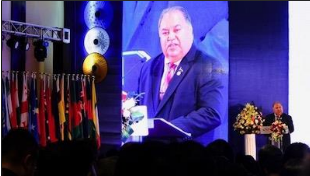
Figure 7: The Hon President Baron Waqa addresses the 3rd Asia Pacific Water Forum on the importance of sustainable water resource management to Nauru’s future