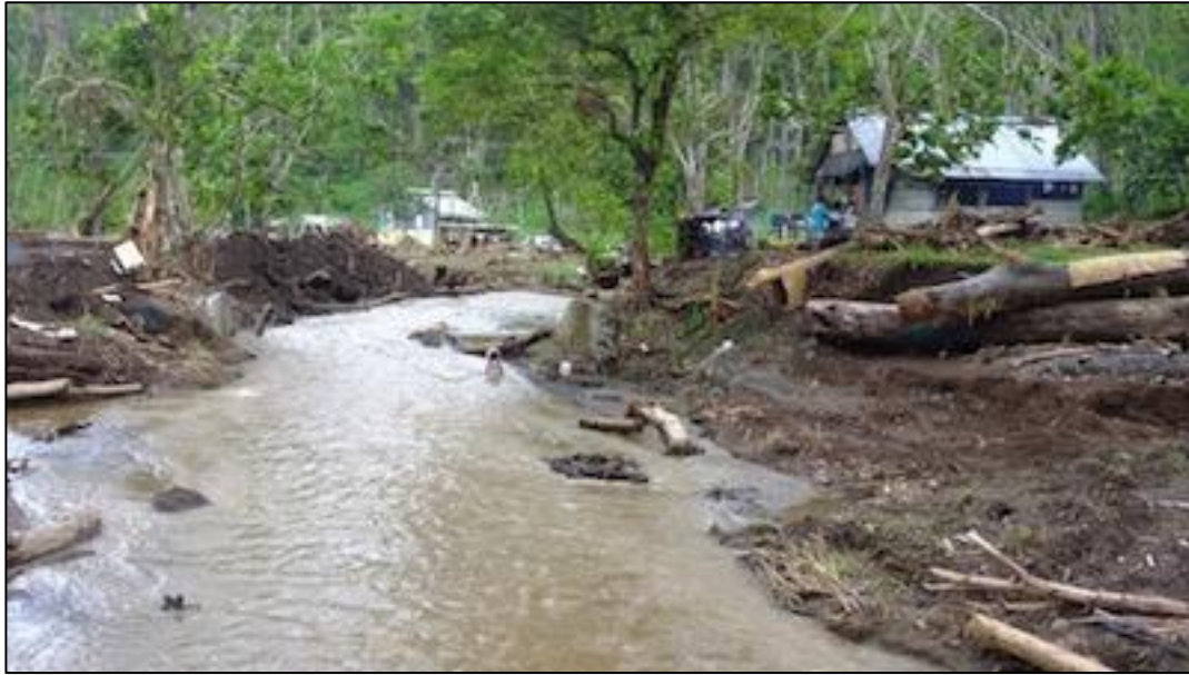
Figure 8: An IWRM approach has enabled Samoa to bring together multiple stakeholders to tackle issues such as water resources management and flood mitigation