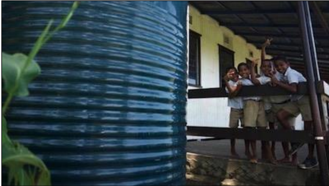
Figure 6: The Fiji WASH Cluster has been instrumental in coordinating water and sanitation recovery efforts in the aftermath of 2016's Tropical Cyclone Winston